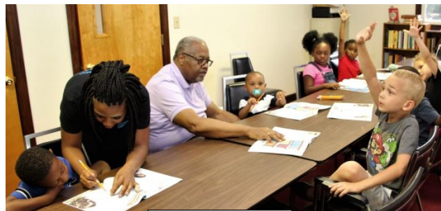
Children 2 - 8