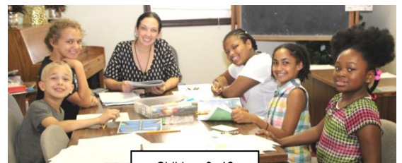
Children 9 - 12